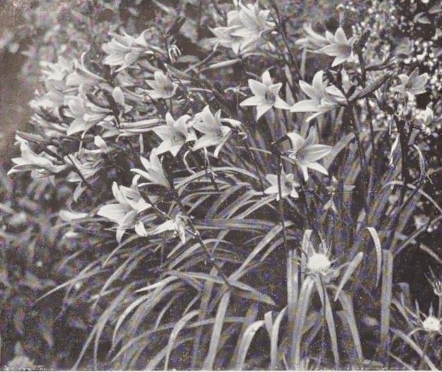
TROUBLE-FREE, GRACEFUL PLANTS